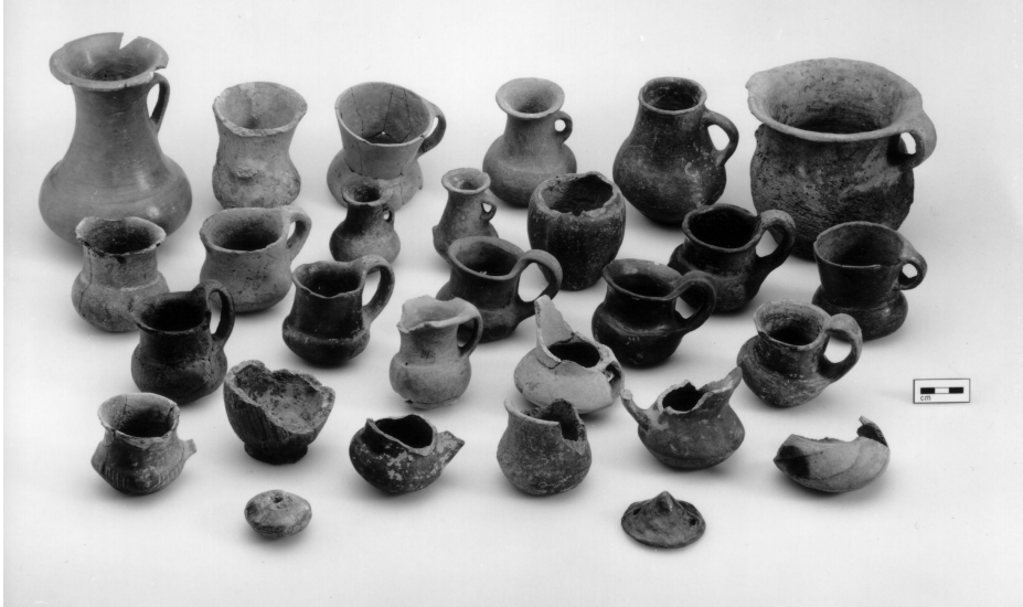
Figure 1. Cups from the CUMAA collection from Tószeg.

why its material is now so fragmented that a full account of where all the objects are is difficult to piece together. This, therefore, is just an outline of the excavation history of Tószeg, with particular attention to the 1927 Cambridge–Hungarian excavations, which is used as a basis for considering the issues raised earlier.