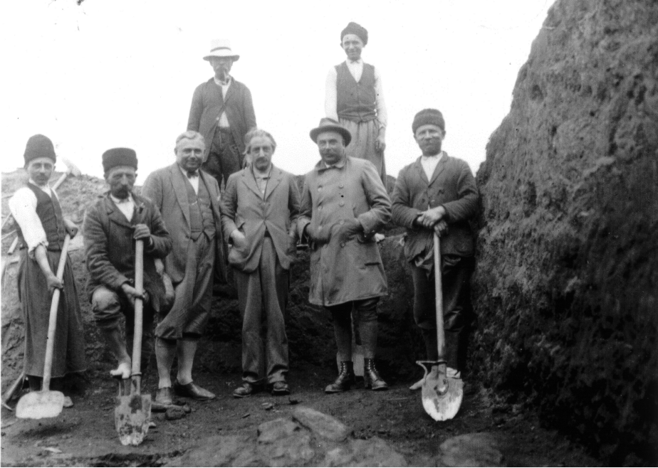
Figure 3. Photograph of the excavation team from 1927 presumably at Tószeg. In the background V.G. Childe (with sun hat and pipe). In the foreground F. Tompa third from the left.

and accommodation arranged. Of course he will begin as fixed. Let us know when you are coming.